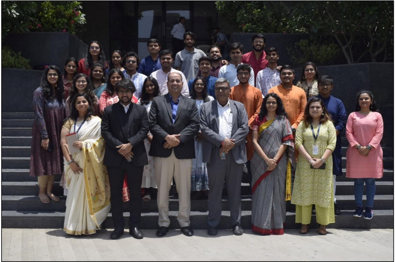
Description of the photo: Group photo with experts, Dean, Faculty of Law, Faculty Coordinators and Volunteers of Legal Aid Society.